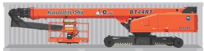
Standard Container Transport